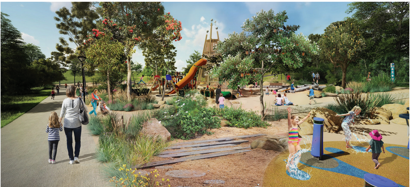
Family and Youth Play Area. Artist impression.