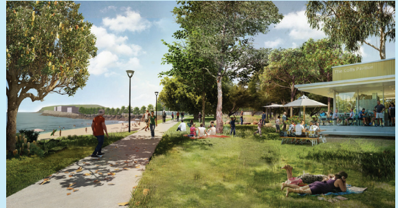
North Park. Artist impression.

The draft masterplan set out a vision for how the Coffs Harbour Jetty Foreshore could be revitalised to meet the community's needs in the future. It proposed key design moves and development outcomes in four key precincts around the Jetty Foreshore. It also suggested possible uses, height limits and building scales for the community's consideration.