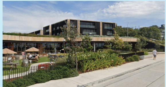
New Visitor Destination, Corambirra Point. Artist impression.