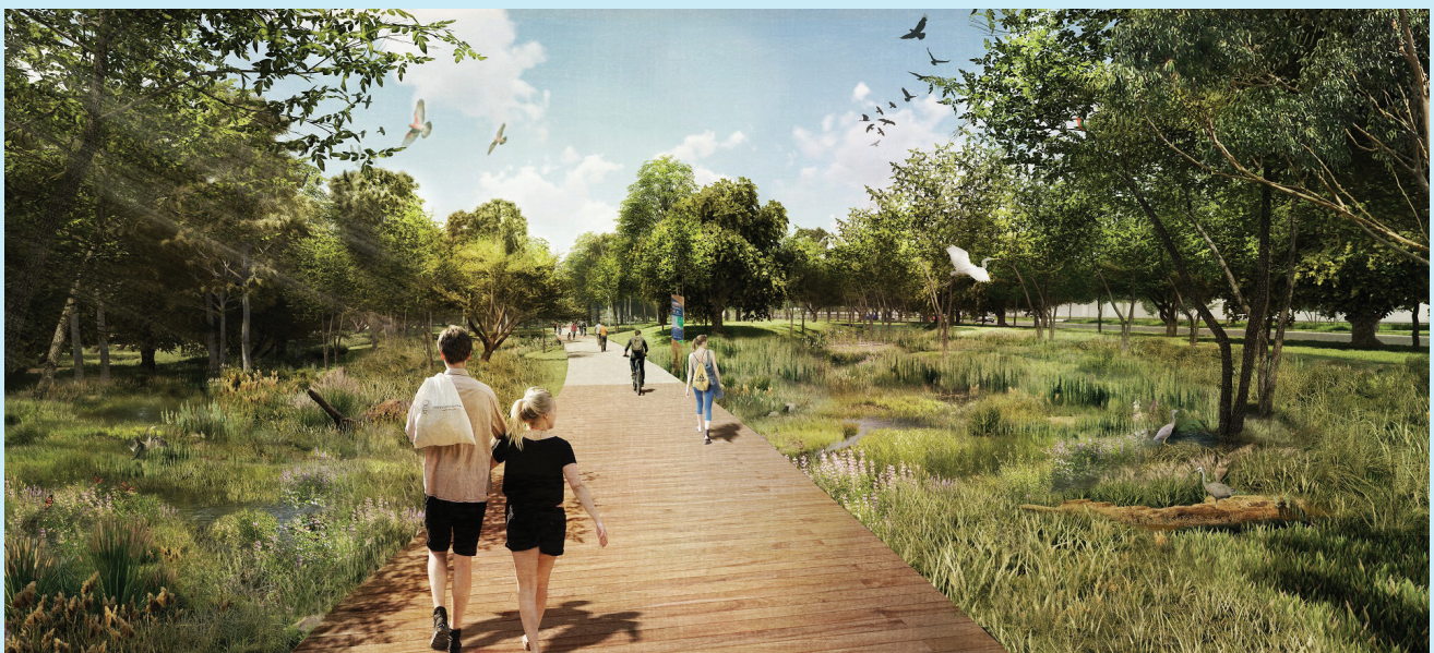
Billabong. Artist impression.