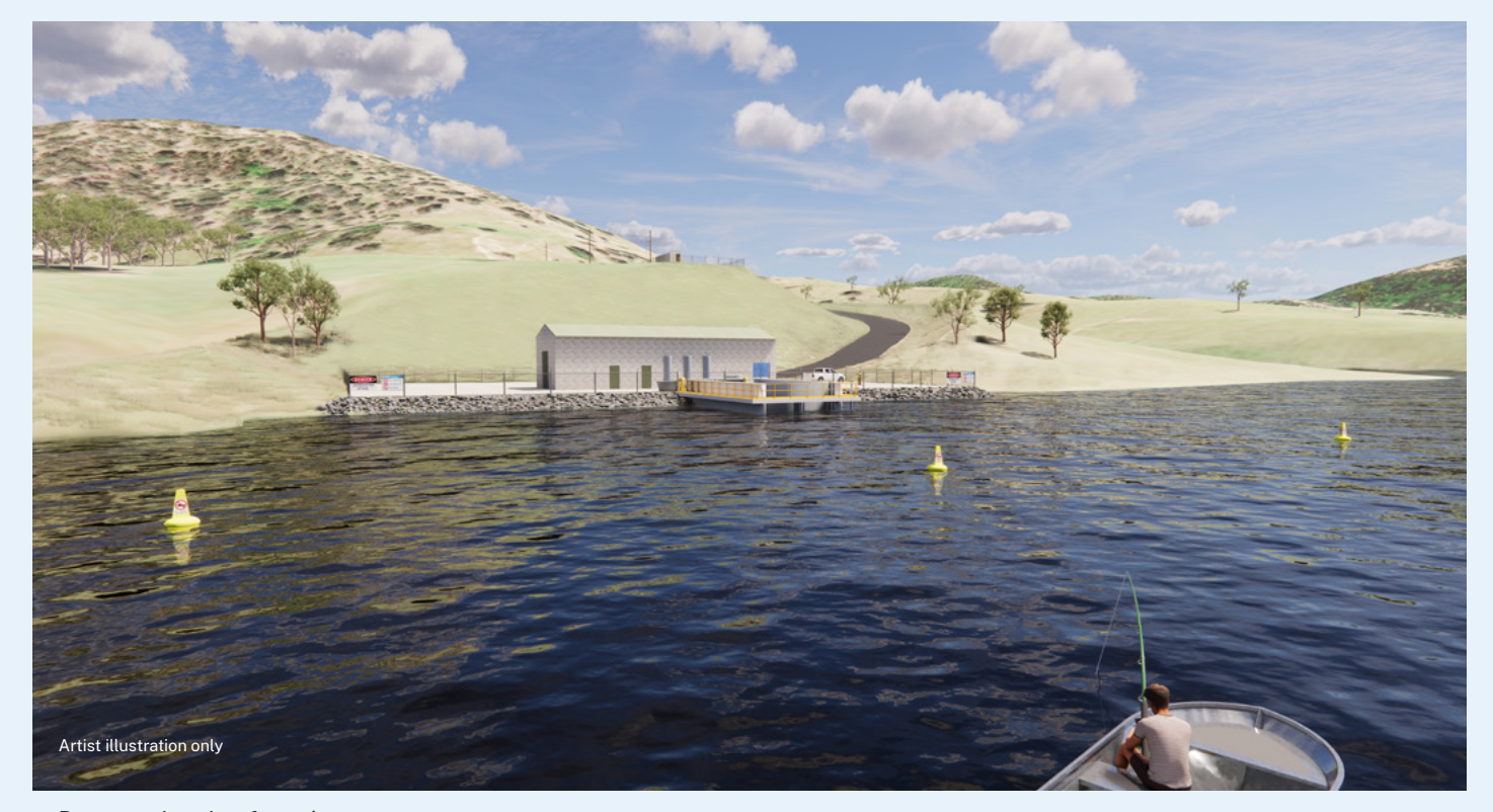
Pump station view from the water

© State of New South Wales through Climate Change, Energy, the Environment and Water 2024. The information contained in this publication is based on knowledge and understanding at the time of writing (February 2024). However, because of advances in knowledge, users are reminded of the need to ensure that the information upon which they rely is up to date and to check the currency of the information with the appropriate officer of the Department of Climate Change, Energy, the Environment and Water or the user's independent adviser. PUB24/161.