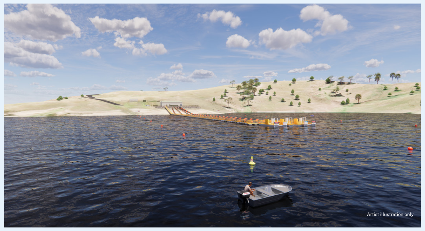
Pump station view from the water

© State of New South Wales through Climate Change, Energy, the Environment and Water 2024. The information contained in this publication is based on knowledge and understanding at the time of writing (February 2024). However, because of advances in knowledge, users are reminded of the need to ensure that the information upon which they rely is up to date and to check the currency of the information with the appropriate officer of the Department of Climate Change, Energy, the Environment and Water or the user's independent adviser. PUB24/162.