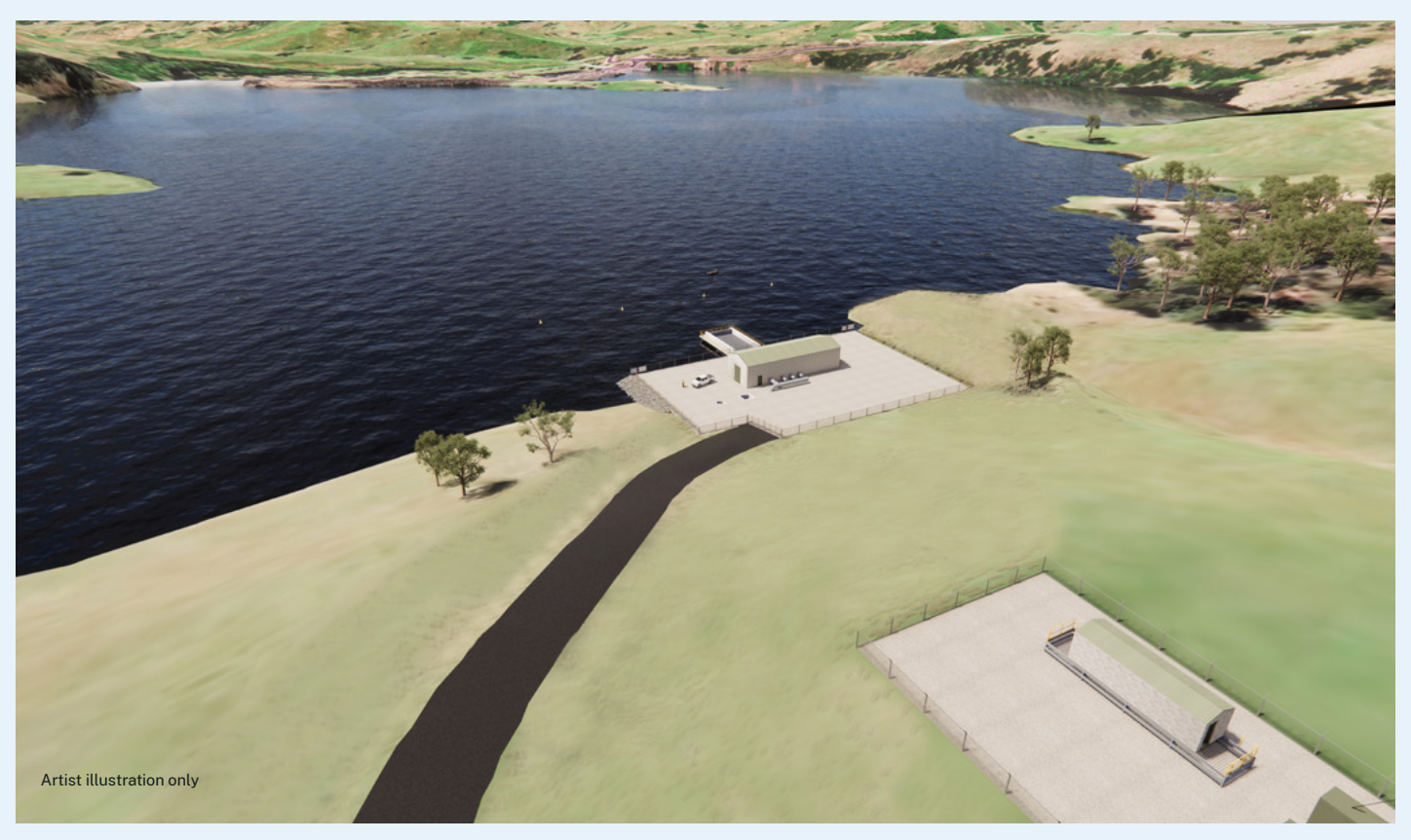
Aerial view looking towards the Lostock Dam wall