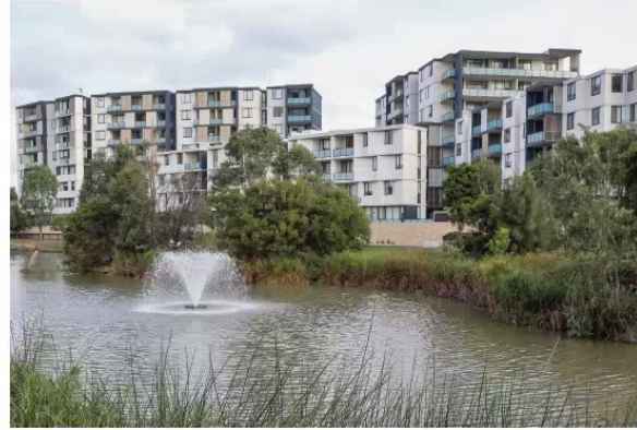
Image: Washington Park, Riverwood

The rezoning process for the new focus area will build on the previous renewal work completed at Washington Park in 2017, which transformed mostly old social housing dwellings into a modern, integrated mixed-tenure community.