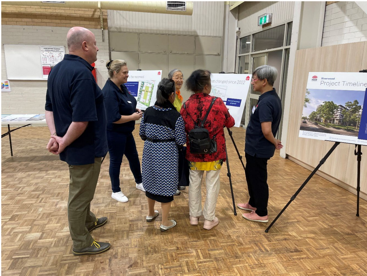
Drop-in session, main room at Riverwood Community Centre, March 2024