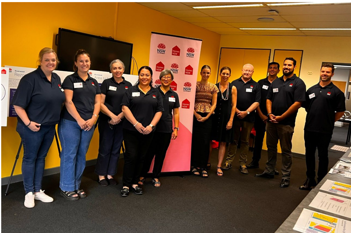
Staff attending a drop-in session at Riverwood Community Centre, March 2024