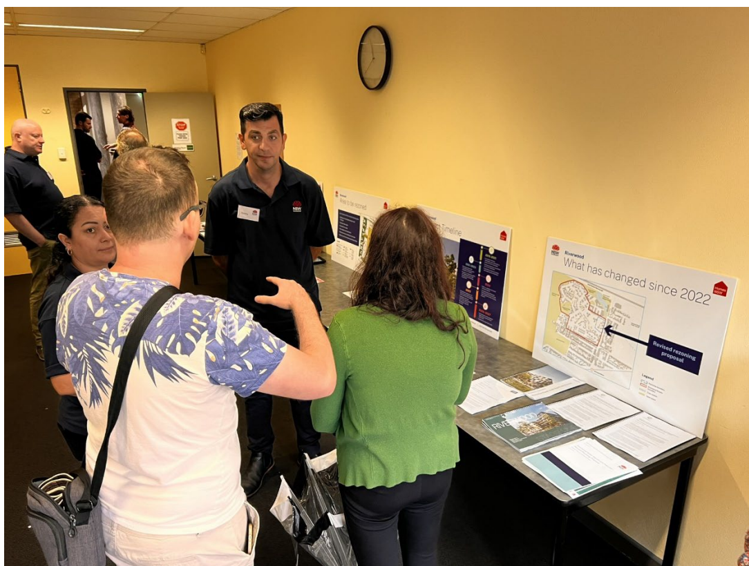
Drop-in session at Riverwood Community Centre, March 2024