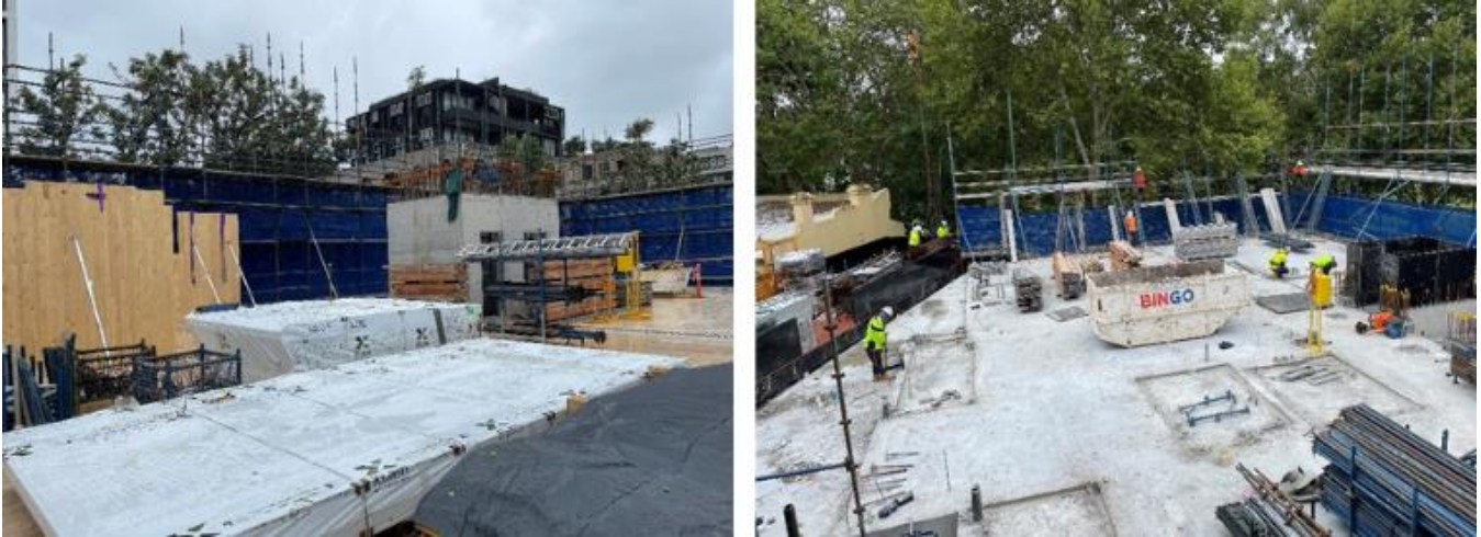
Left: south tower in progress; Right: level 1, north tower